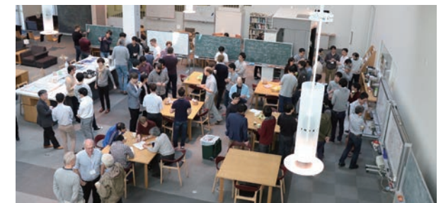
Tea time at Kavli IPMU