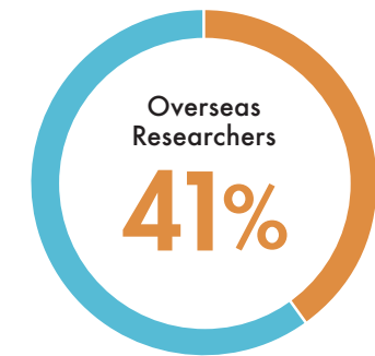
The average percentage of overseas researchers at WPI centers (2018)

WPI creates vibrant international research environments that attract frontline researchers from around the world.